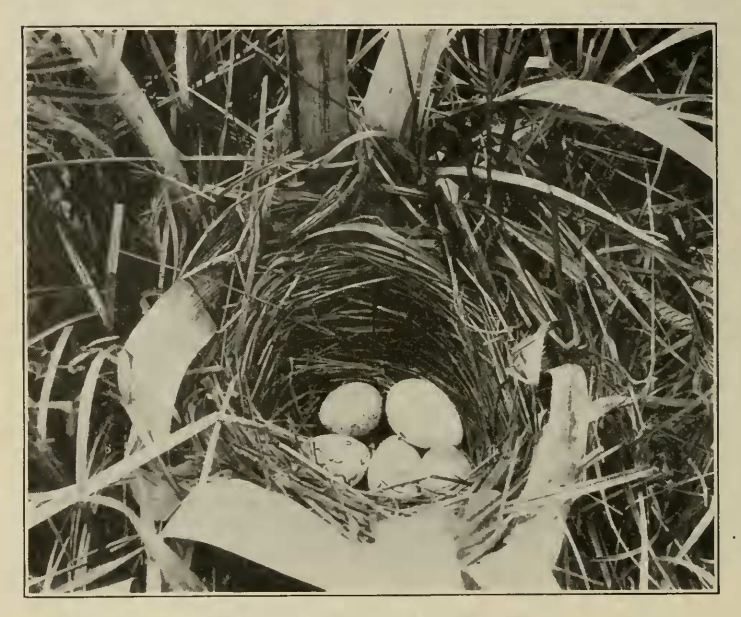
RED-WINGED BLACKBIRD'S NEST Containing Two Cowbird's Eggs

25. Sayornis phoebe. Phoebe. One pair nested in 1910 and 1911 under a small wooden culvert in the road in front of the farm.